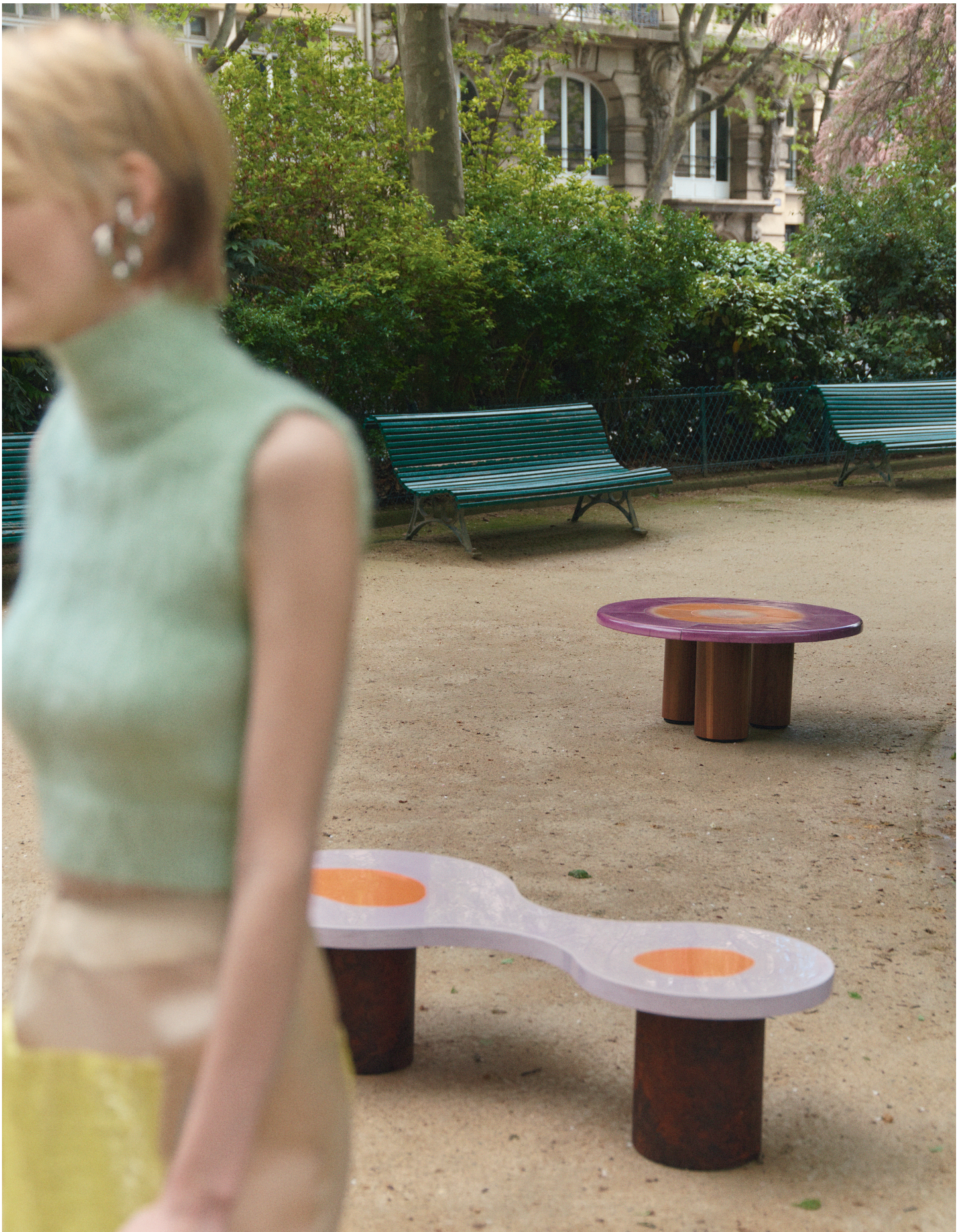
This page Uchronia Peanut coffee table and Cookie low table , POA, from Studio Alm. Model wears sleeveless jumper with high collar, POA, from Paco Rabanne; maxi mesh skirt with sequin detail, $2007, from A.W.A.K.E Mode; and Mega ear cuff and Mega earrings , POA, from Balenciaga.